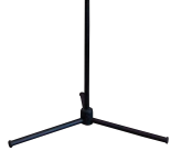
Summit shown with optional literature rack