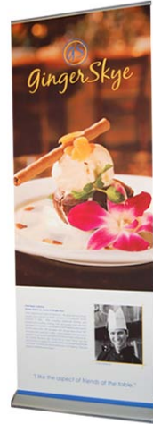
QuickScreen 3 19" shown

The Courier banner stand is a lightweight value driven fabric banner stand, ideal for lobbies, museums, stores, and showrooms