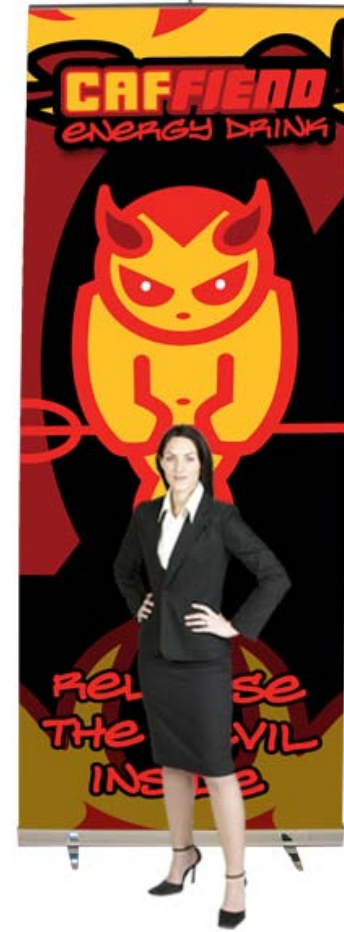
MediaScreen XL shown

Spider is ideal for high-volume indoor applications at an economical cost