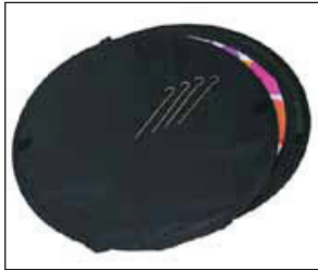
Graphic case included.

The unique design of the Kapow makes transportation and assembly simple. The carry bag is the base of the display. Just unhook the graphics from the base, collapse them and put into the circle carry bag and go.