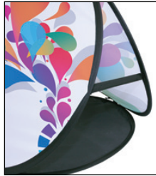
Graphic and Carry Case connected