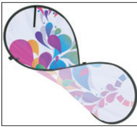
Graphic easily twists for quick set up.