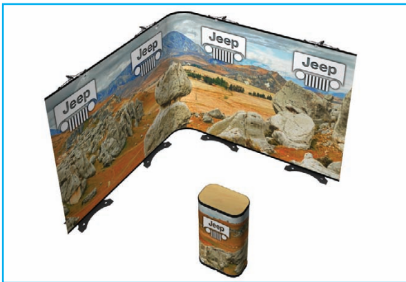
Two Twist Kits and one additional Flexi Connector panel combine to form a corner display.