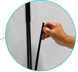
AN EASI-LINK KIT (3 magnetic bars allow you to connect Twist stands together)