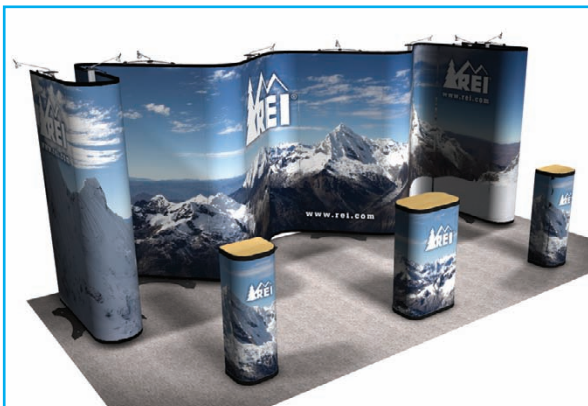
Four Twist Kits and Three Flexi Connector panels fill up a 10' x 20' display space.

The most flexible, modular portable exhibition system. An exhibition stand that is different! Twist offers incredible flexibility, stability and ease of use. The Twist has been designed to fulfill a wide range of exhibiting solutions, from 10' spaces to endless backwalls.