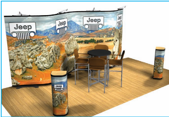
Two 8ft Twist kits w/Lambda Bright, 1 Flexi Connector panel & 2 single cases w/graphic